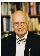
Martin Marty, Professor Emeritus, University of Chicago