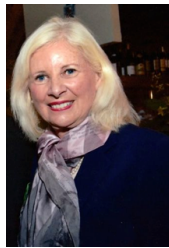
Hon. Rhoda Sweeney Retired Circuit Court Judge Illinois